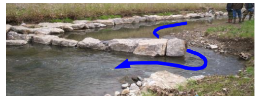
Typical Flanked Structure