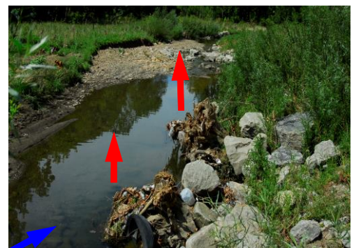
Root Wads Causing Bank Failure